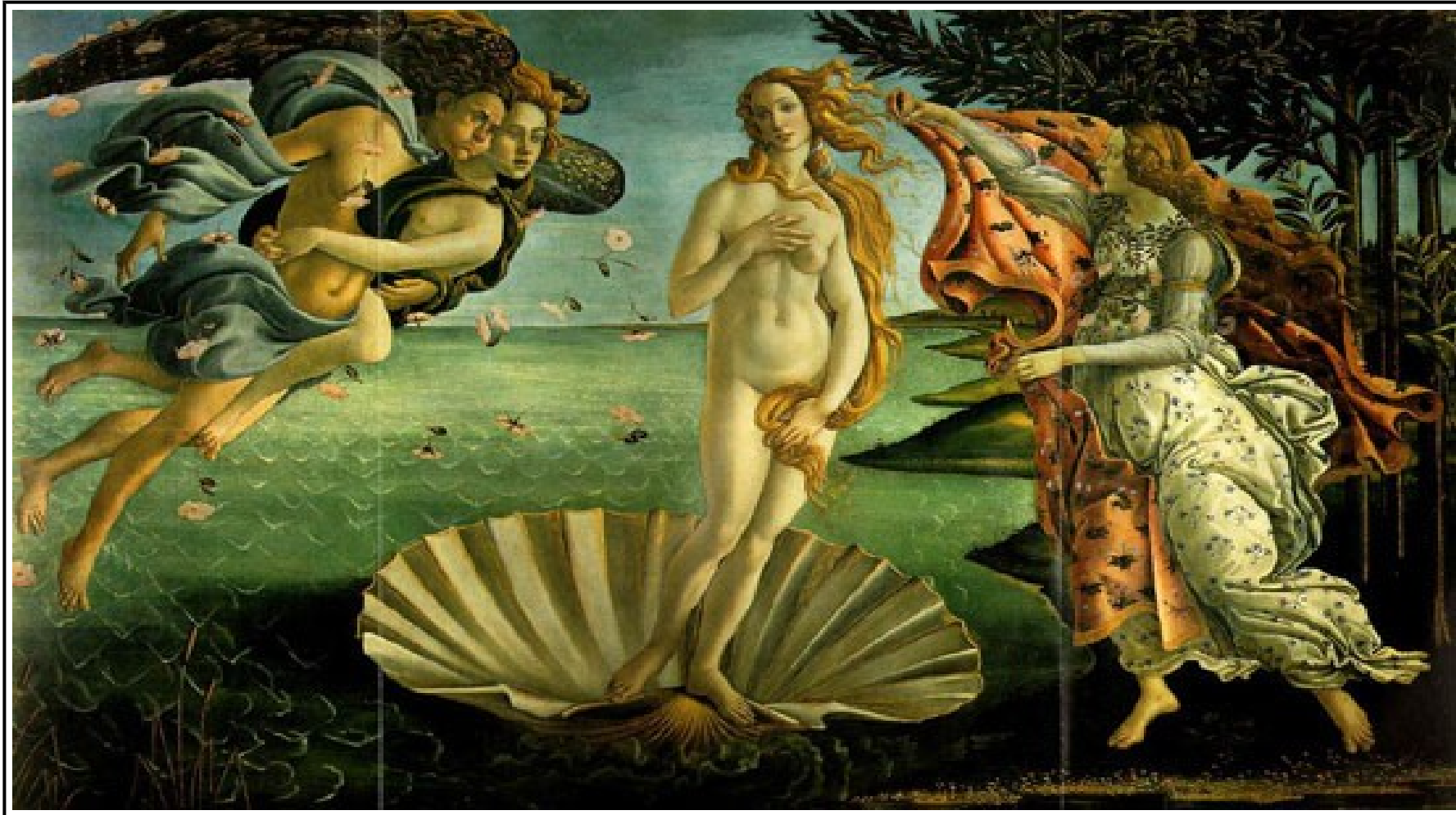
Birth of Venus by Botticelli